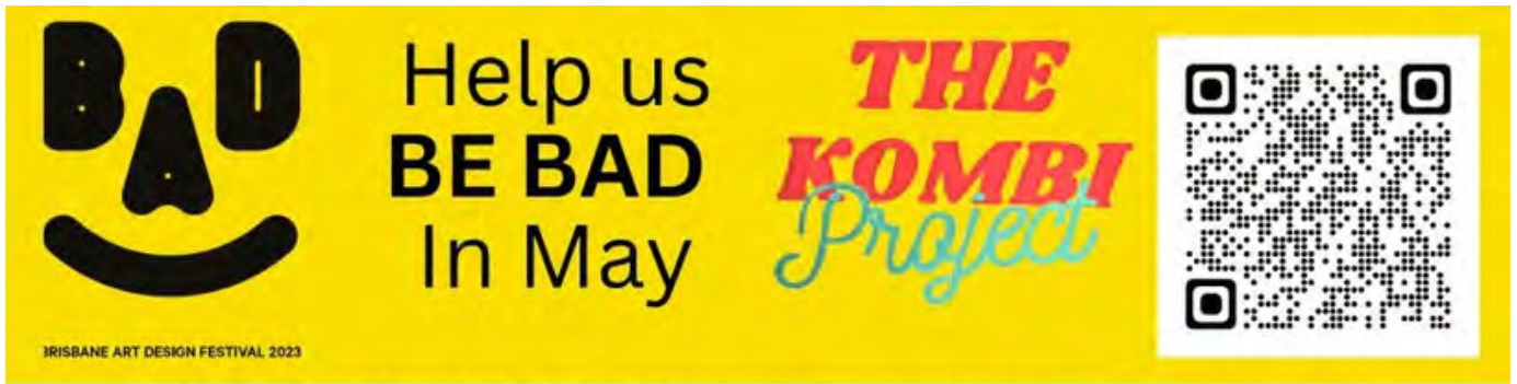
EXHIBIT YOUR KOMBI ART & CRAFTS