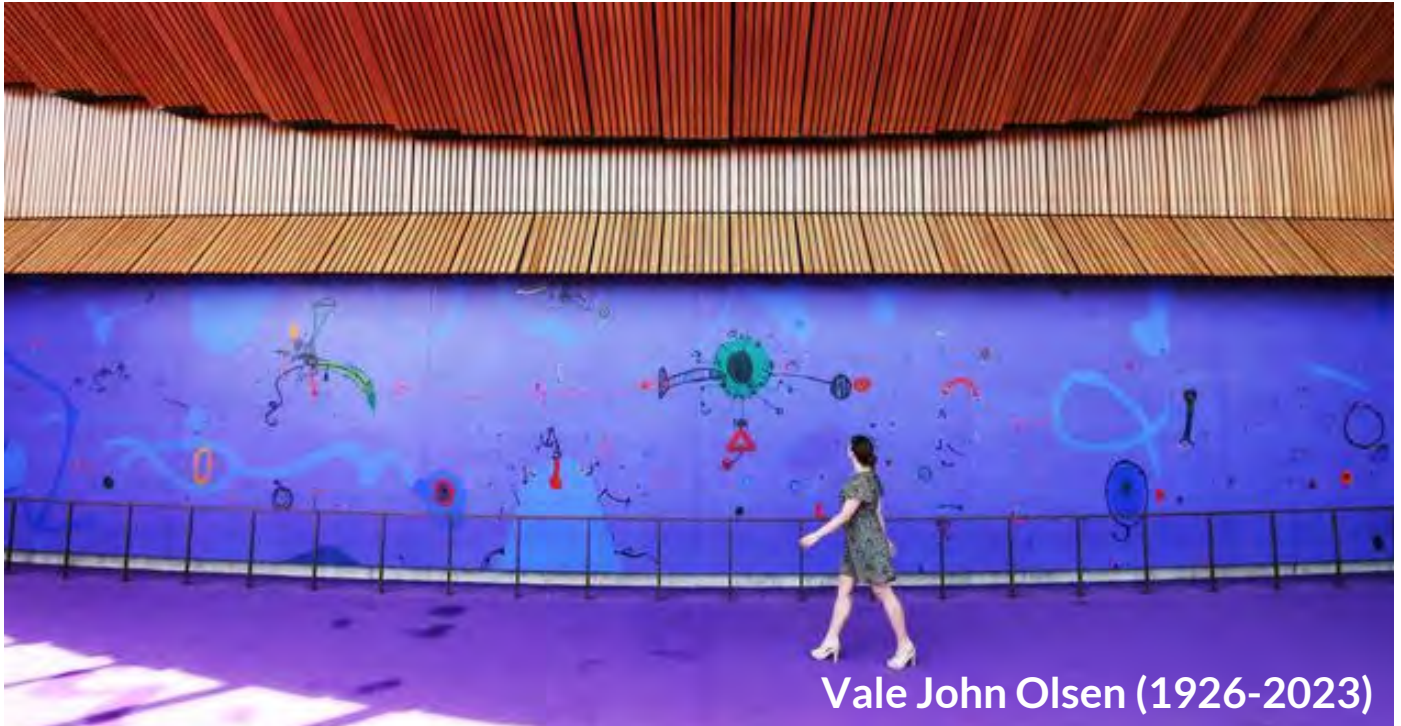
Vale John Olsen (1926-2023)