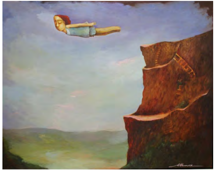
Do we all dream of flying?