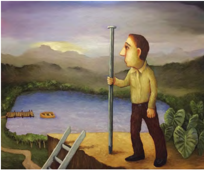
A Lever and a Place to Stand