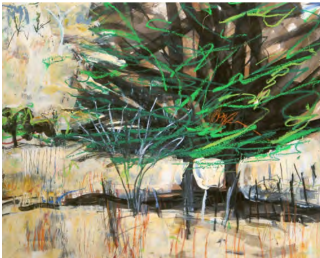
Old Macrocarpa Trees 2: Bull Bay Bruny Island Mixed Media on Paper

To study and connect with a new location, I work intensively en plein air . As she arrives, her focus is on being present and aware of her surroundings: walking, listening, feeling, surveying, and collecting things along my journey. She begins by making marks, loosely feeling the lay of the land with her pencil, and builds up the surface of the canvas with layers of mixed media and new marks. She paints, scratches, and erases and incorporates materials found on location, such as twigs, branches, feathers, and ochres.