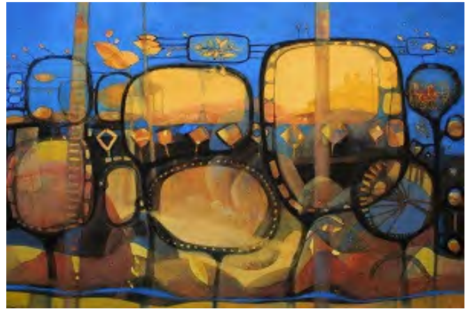
Reflections on a Country Town, 2004

Caloundra Regional Art Gallery, Omrah Avenue, Caloundra, Qld. Until June 26th