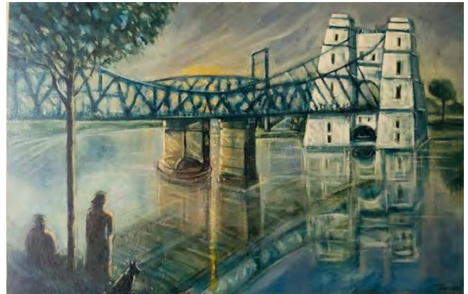
Indooroopilly Bridge Sunset Oil on Canvas

In 1972, he travelled to Australia as a ten pound Pom. Having always wanted to study art, his arrival in Australia was timed perfectly and he went on to spend six years, studying part time, at the Queensland College of Art, majoring in painting with a secondary major in sculpture. On completion, more study ensued as he gained his teacher qualification. A 30 year career as an art teacher was the result.