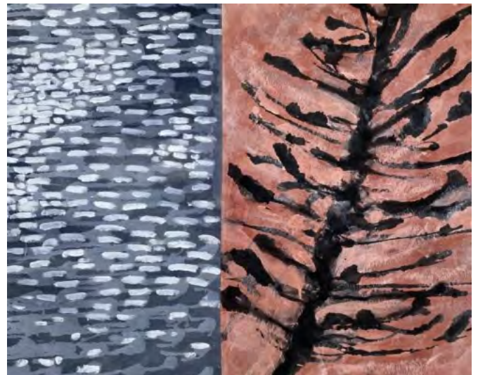
Coastline 2022 Gesso, acrylic, ink, pigment on stitched canvas