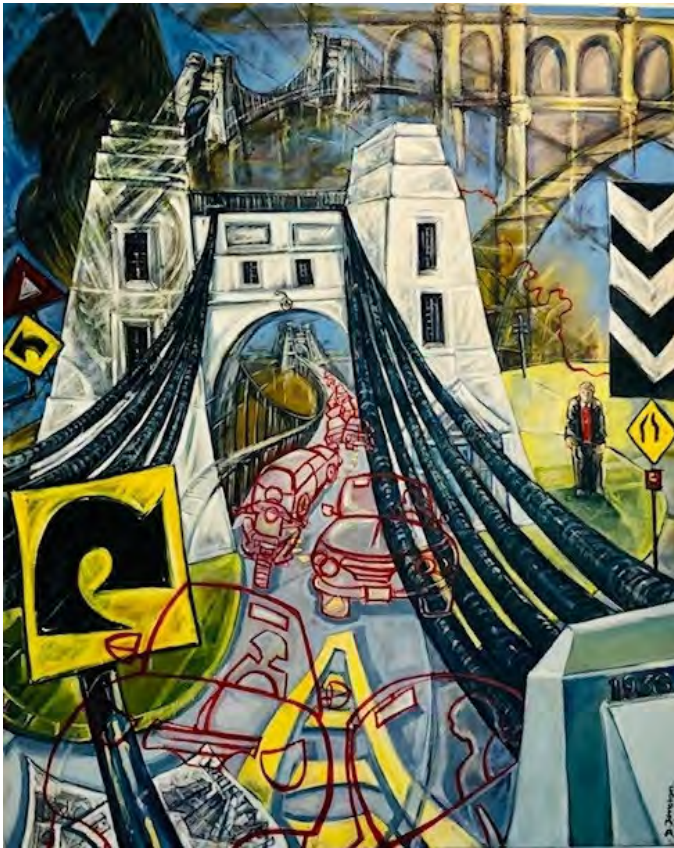
Bridge History Oil on Canvas