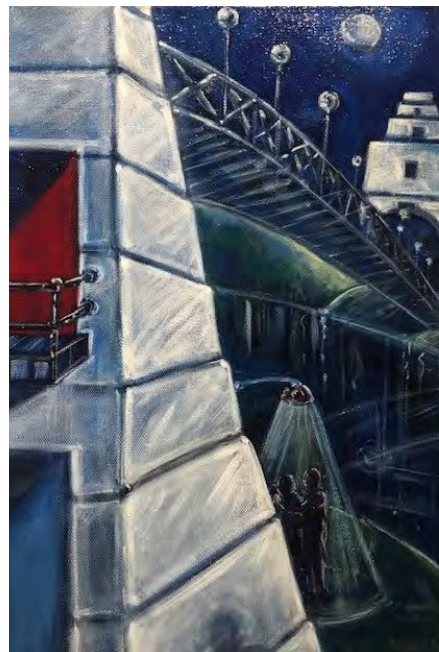
Bridge Tryst Oil on Canvas