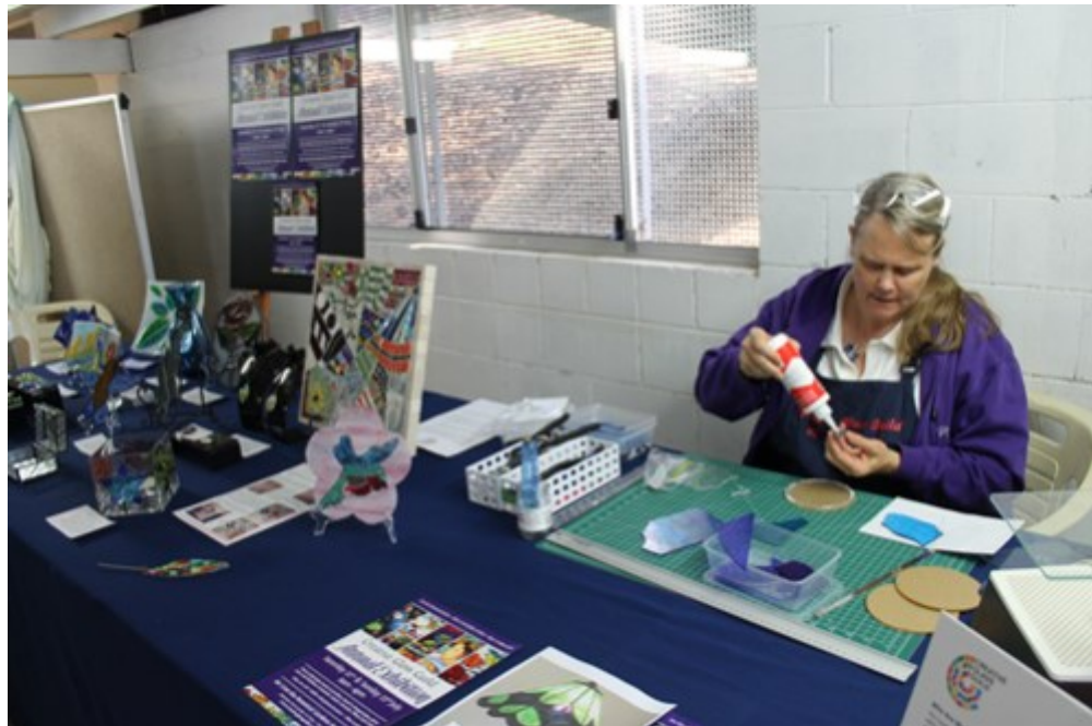
Queensland Leathercrafters, Creative Glass Guild and the Queensland Enamellers Guild were among the groups demonstrating downstairs, had to love the leathercrafter using any old doorknob to hang her braiding, kept her busy all day.